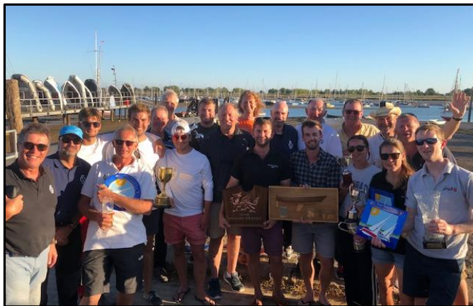
2022 Sonata Nationals Brightlingsea – Medway Fleet