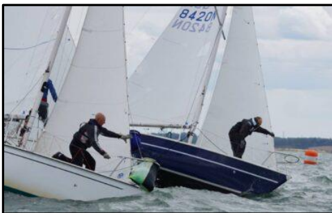
Medway Regatta 2021

In 1920 a clubhouse was opened on the Esplanade near Rochester Castle. During WWII at least six MYC boats were involved in rescuing troops from Dunkirk. In 1948 the club moved down river and the current site at Lower Upnor was acquired. In 1953 MYC received its warrant from the Admiralty allowing members the privilege of wearing a defaced Blue Ensign. Two years later saw Bluebottle, HRH the Duke of Edinburgh's International