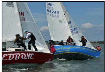
Sonata Eastern Championship 2022 - Medway