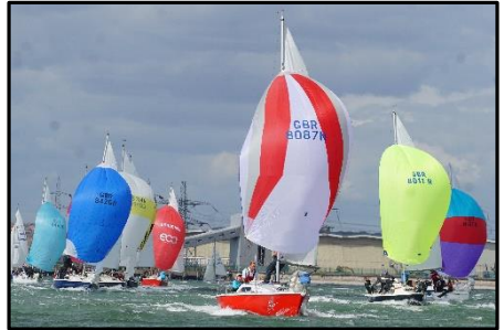
2018 Sonata Nationals - Medway

Racing will be within the vicinity of Long reach / Pinup Reach which is a 30–45-minute motor downriver from the clubhouse.