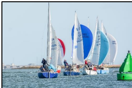
Medway Sonatas Club Racing

There will be one fleet comprising of the lift and fin keel entries, all battling to become National Champion.