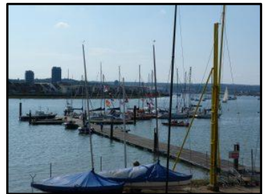
Medway Yacht Club Pontoon

Medway Yacht Club has an all-tide pontoon. We will attempt to accommodate all visiting boats on the pontoon, if you wish to stay aboard your boat, please let the organising committee know and we will make sure you have a space reserved.