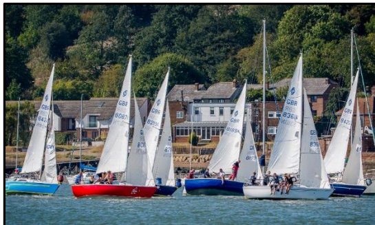
Medway Sonatas Club Racing

The online entry form is available through the Medway Yacht Club website and payment is to be made by bank transfer. Alternatively, the form can be downloaded, completed, and sent back to Medway Yacht Club Office.