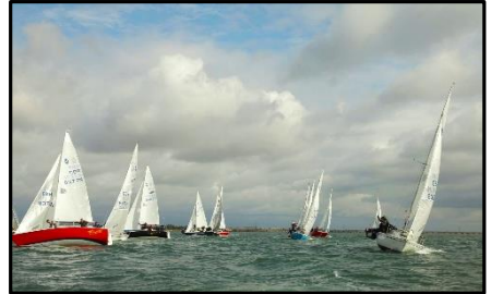
2018 Sonata Nationals - Medway

An 'around the cans' race will be sailed, making use of the many creeks, wrecks, and navigational marks. This will give visiting boats the chance to sail further and see the history of the River Medway, while also giving a chance to test navigational skills.