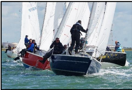
2018 Sonata Nationals - Medway

The River Medway has many bends and reaches making it ideal for setting courses in any wind direction. The tide adds additional tactical challenges.