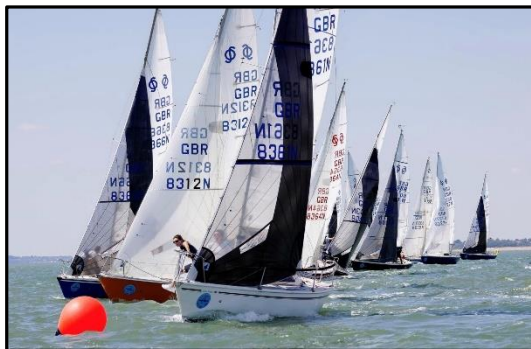
Brightlingsea Nationals 2022

Medway Yacht Club is the hosts of the Pirates Cave Sonata Nationals 2024 and look forward to welcoming you for 4 days of exciting and challenging racing on the tidal River Medway. At least 25 boats are expected (that's over 100 people) racing and enjoying the social events each evening from the club house and terrace.